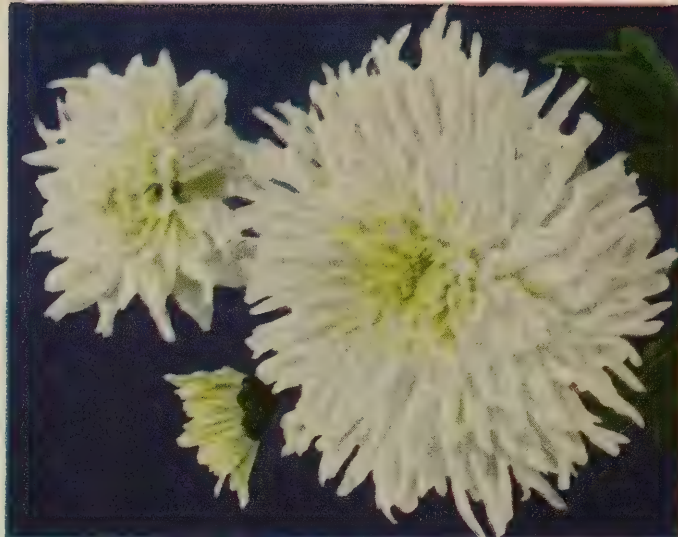
SPINDRIFT. $1.00 each; 3 for $2.50